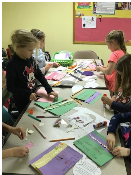
(on the right: children assemble their own book of prayers)

Second graders are currently preparing for their First Reconciliation which is coming up so quickly. Catechists have been helping them learn their prayers using a variety of strategies.