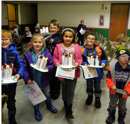
(above photo: children proudly display their Advent wreaths)

Come check out what we've been doing in Faith Formation Classes this year!